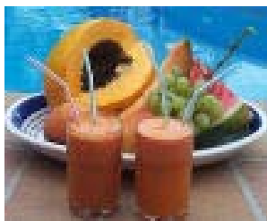
ORAC scores are higher in fresh fruits and vegetables.